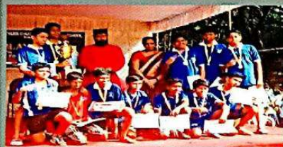
All Kerala Interschool Football Tournament Overall Champions (Junior Category)