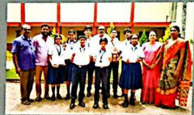
ISC Boys secured First and ICSE Boys and Girls secured second