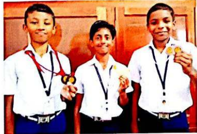
Medal winners in Pathanamthitta Dist. Roller Skating Championship