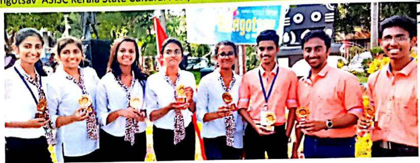
3rd prize Western group song (ISC)

First prize in Manorma Saintgits BIG Q Challenge Quiz, 2019.