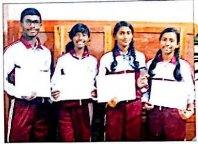
ASISC National Athletic Meet held at Pune, Maharashtra