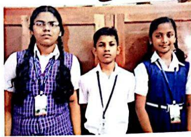
Gold Prize winners of handwriting competition conducted by International Handwriting Olympiad Organisation