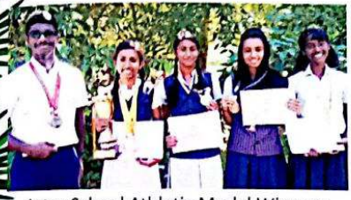
Inter School Athletic Medal Winners