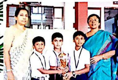
Inter School Team Chess Championship – 2019 Second Prize – Category 1