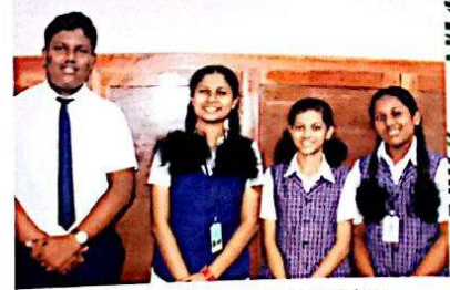
Winners of essay competition conducted by Mahatma Gandhi Trust, Muthoor Thiruvalla