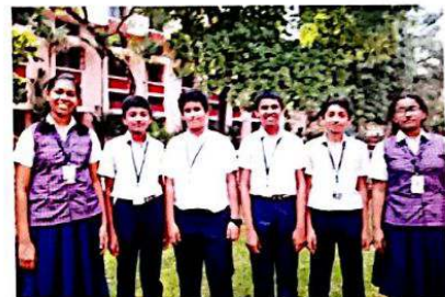
ASISC Table Tennis Competition held at Bangalore