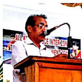
Inauguration of CISCE Inter Zone Table Tennis Tournament