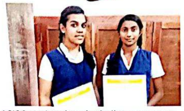
ASISC National Basketball Tournament held at Tuticorin, Tamil Nadu