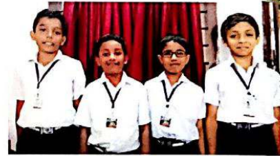
State Level Open Table Tennis Tournament held at Ernakulam Silver Medal in Cadet Team Championship